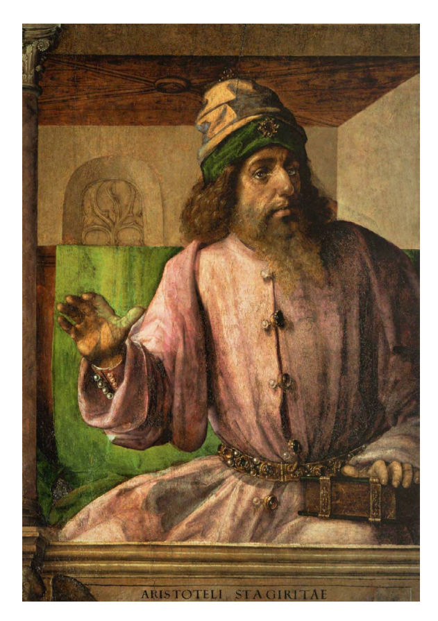
Figure 3 Aristotle (Giusto di Gand, 1476. Painting in Federico da Montefeltro's studiolo)

These proto-individualist practices belonging to a spatial "interior turn" are simultaneous, in the 17th century, to the Cartesian "epistemological turn" a "subjectivist turn" strengthened by activities such as reading (facilitated by the new printing press), relevant when considering a literary genealogy of the self (Lajer-Burcharth & Sontgen, 2016), added to a pictorial genealogy revealed by portraits and customized decoration. It is then when the autobiographical writing spreads among the social elite: a form of experience of the self that requires a certain type of furniture (secretaires, booksellers, lecterns). And it is also at this time (in the 15th century, according to the Oxford Dictionary) when the English word interior appears to designate a contrasting space with the outside (Rice, 2007), and the word privacy, until then used to legally designate a nonpublic property domain, is used to talk about something secret or occult by someone.