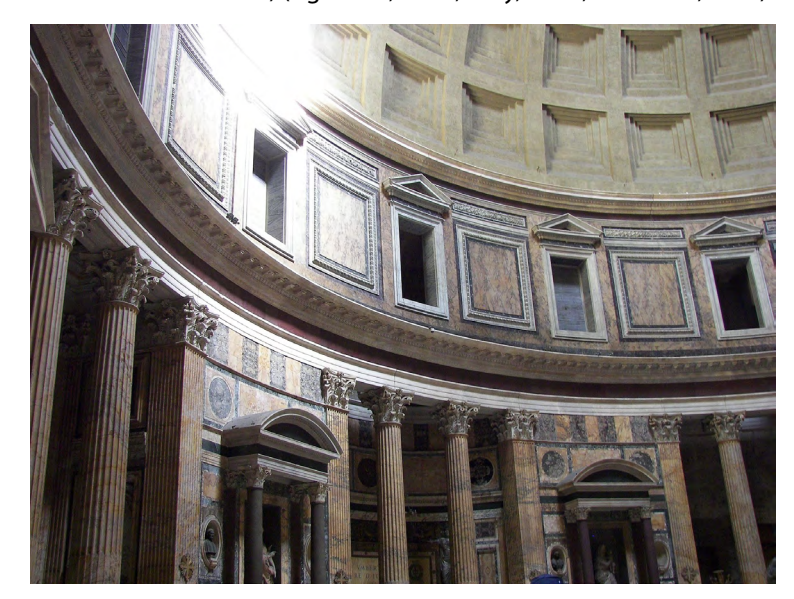
Figure 1 Roman Pantheon

that is consubstantial with the idea of design. In it we find axes, destinations, closures and especially thresholds (Abercrombie, 1990). To enter an interior is indeed always to walk across a mobile or fixed threshold, an experience that can be lived as a homecoming, a form of topophilia (Tuan, 1974), recovery of the happy space. Or it may be something sacred, as it was to enter through the portico into the internal cavity of the Pantheon in Rome, where spirituality is more evident than in the caves because we know exactly the kind of rituals that were carried out. For the Austrian historian Riegl (1985) the Pantheon is a fundamental milestone in the creation of the first architectural interiors. According to Giedion (1971), it inaugurated the second age of space, that which envelops a large interior given by the Roman arch, vault and concrete technology. When the Pantheon became a Christian church, a community of people could be gathered to hear sacred texts, experiencing for the first time an elevated form of physical and spiritual, as both collective and individual interiority. New technology strengthens and coincides with a running cultural transformation, in this case, the search for spirituality, the central concern in St. Augustine, who seeks inwardly the path to truth and divinity through self-knowledge (in interiore homine habitat veritas) (Agustine, 2006; Cary, 2000; Chiariello, 2015).